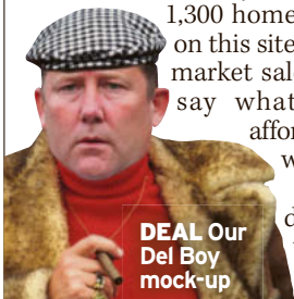
DEAL Our Del Boy mock-up